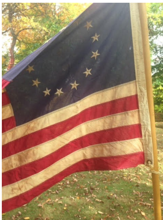
Flag from the Revolutionary War

We are hoping he will give a lecture sometime this spring.