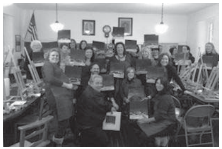
The January participants show off their art works.

Each session is limited to 20 people. Visit soleburyhistory.org today to sign up for one or both of these events ($50 pp).