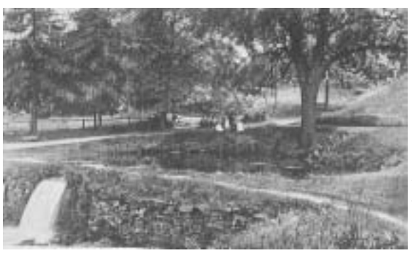
Early photo of Ingham Spring in Solebury. More about this spring in the next newsletter.

Many thanks for thinking of STHS in your spring cleaning.