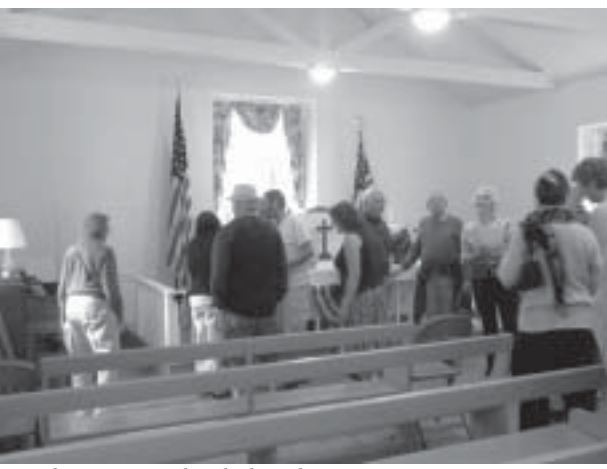
Inside Mount Gilead church