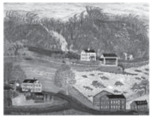
Joseph Pickett's 1914 painting of Coryell's Ferry in 1776

On the afternoon of April 29, 2014, five intrepid teachers from the New Hope-Solebury School District braved the cold and wind to learn about George Washington's time in Solebury Township during the Revolutionary War. Washington was here twice during the war: in December 1776 before the Battle of Trenton and again in June 1778 before the Battle of Monmouth. Known then as Coryell's Ferry, this area of Solebury Township that would become New Hope played an important strategic role during the Revolutionary War. The ferry crossing was traversed countless times by messengers, suppliers and military detachments. Following the capture of Philadelphia in September 1777, Coryell's Ferry was one of the few river crossing points between Pennsylvania and New Jersey free from enemy interference. Redoubts built into the hills provided protection for the guns and soldiers that defended the small village and ferry crossing.