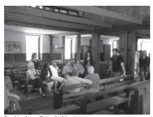
Buckingham Friends Meeting

1830s and lived there for the rest of his life. He worked at Cintra, served as the town crier, and as an old man he boarded at the Delaware House, now the New Hope Starbucks.