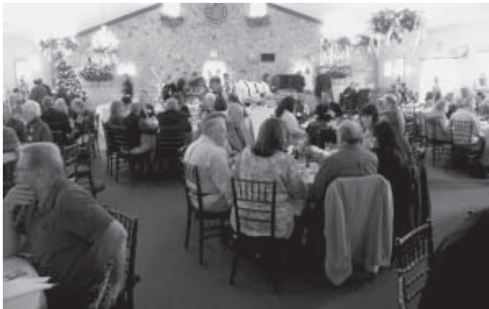
Our friends and neighbors enjoy a delicious brunch.