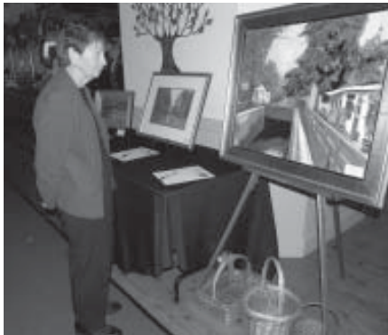
A guest looks over the three original paintings donated for the Silent Auction.