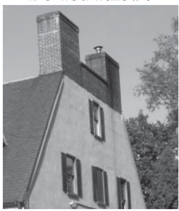
Double chimneys were not very common in Solebury. Do you know what historic public building has these?

Call 215-297-5091 or email soleburyhistory@verizon.net with your answer. You may win a prize!