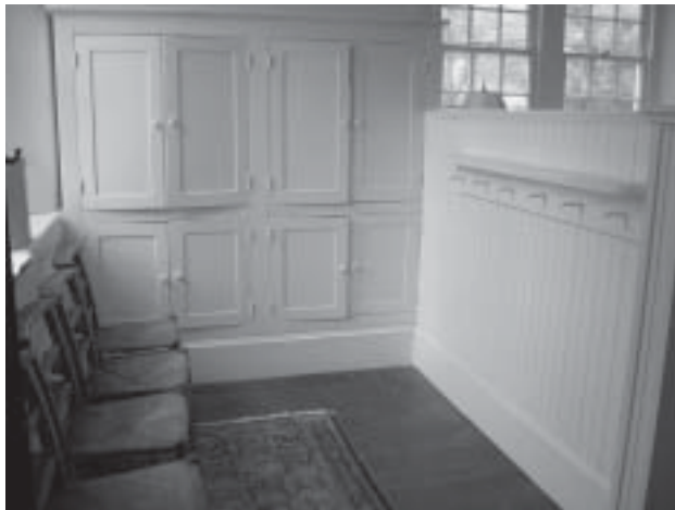
The entrance foyer contains refurbished original cabinets, a divider wall with coat hooks, and a few of the chairs donated by St. Philip's Chapel.