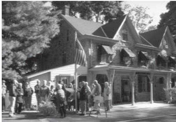
Solebury Post Office