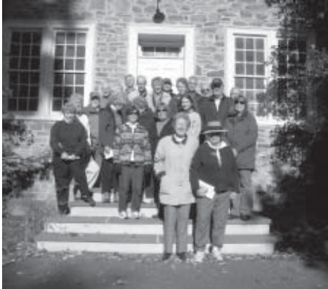
Group pauses in front of the schoolhouse

The group went on to take a peak at the one-room schoolhouse which was under construction at the time. Then a stroll through the yards of 4 historic homes