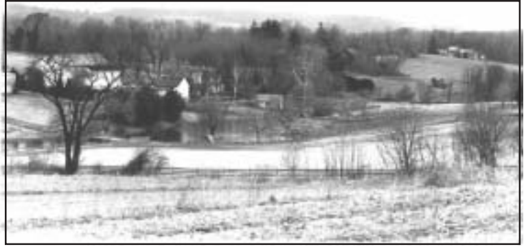
The viewscape of the Upper Aquetong Valley is virtually unchanged in 250 years.

Another important industry once thrived along this valley. A limestone belt stretches from Lahaska to Centre Bridge, and hence the limestone industry became an important adjunct to the agricultural activities of the valley. Quarries and kilns dotted the entire area. During the 19 th century, Meetinghouse Road was called Limekiln Road due to the large number limekilns scattered along its length. Lime was first used for soil conditioning. The presence of limestone and the Aquetong Creek spurred another industry in the valley: tanning. The tanning industry required water and lime with which to soak hides in order to remove hair. Hides were soaked in vats called "limes". The tannery was located near the western boundary of the district (near Aquetong Road). The tanning vats are slight round depressions along the stream bed approximately five feet in diameter. The vats have been filled in over time. In an