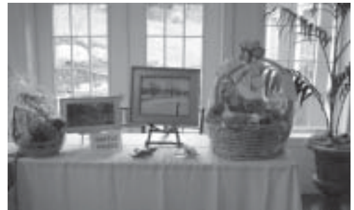
Six wonderful raffle prizes were won at the brunch