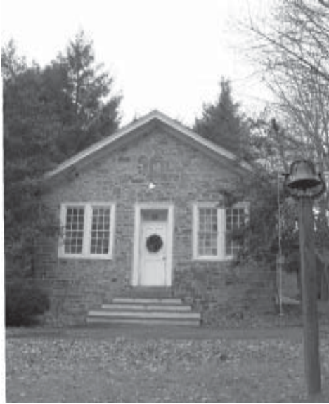
The Society's new home is a one-room schoolhouses at the intersection of Route 263 and Sagan Road. Note the bell on the right.