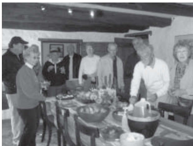
Yummy treats in a bucolic setting.