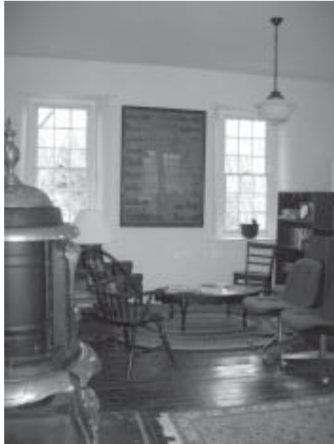
An inviting space for research and reading. Our framed 1859 map of the township adorns the wall.