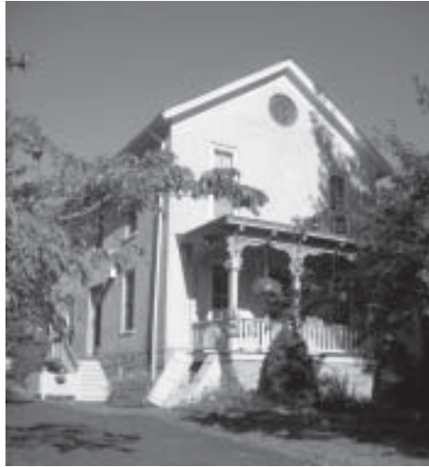
Solebury Hall, former Grammar School

along Rt. 263 (with permission!) brought us to the Solebury Hall. Built in the mid-eighteen hundreds, this building served for a time as the Grammar School (grades 5 to 8). The historic Trinity Chapel and Solebury Post Office were also included. The walk concluded in Linda Kenyon's converted barn for a lavish refreshment break.