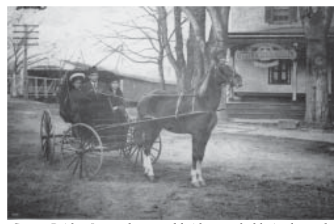
Centre Bridge Inn and covered bridge, probably in the early 1900s.