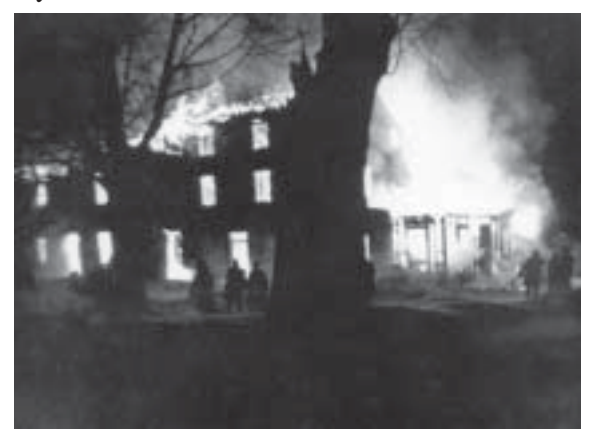
Fire at the Inn in 1932.

A disastrous fire at the Centre Bridge Inn on Halloween night in 1932 left only one small section standing, which was fenced off and vacant for about 20 years. In 1952 the inn was rebuilt as a two-part fieldstone structure typical of houses in the area. In 1960 it caught fire again and burned to the ground. The fire took place on one of the coldest nights of the winter when water in the Delaware Canal was frozen solid, so all that the local firemen could do was to stand and watch. The owner at the time was infatuated with things southern , so he rebuilt the inn in 1961 in the style of a Georgian Williamsburg mansion, as it stands today.