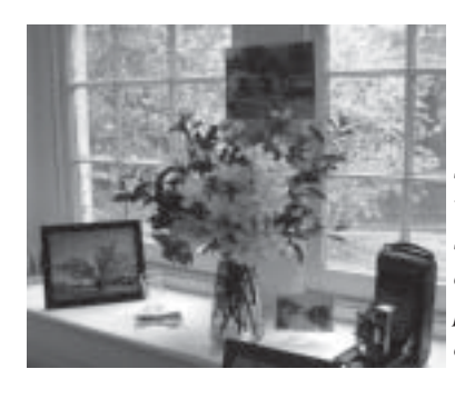
The schoolhouse was decked in spring flowers along with a photgographic display