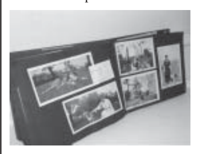
photo albums. They had blank black paper and the photos were held in place with sticky triangle corners. Such an album from the Ruth Fell family is on display in the museum. Visit weekdays between 8:30 a.m. and 4 p.m.

Once the pictures were in hand, it was time to put them into