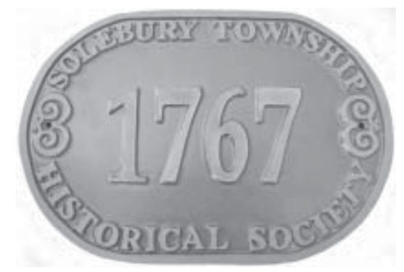
The beautiful terracotta plaques are 12" wide by 8" high and have terracotta red letters on dark green.

Perhaps as you have driven through historic areas around our country you've noticed plaques on houses and other buildings. These plaques normally identify the date or circa date when a structure was built. Not only do they commemorate a building and the stewardship of the owner, but in many cases they were provided by historic societies. Their display shows the owner's pride in their house as well as their support for the Society that issued them.