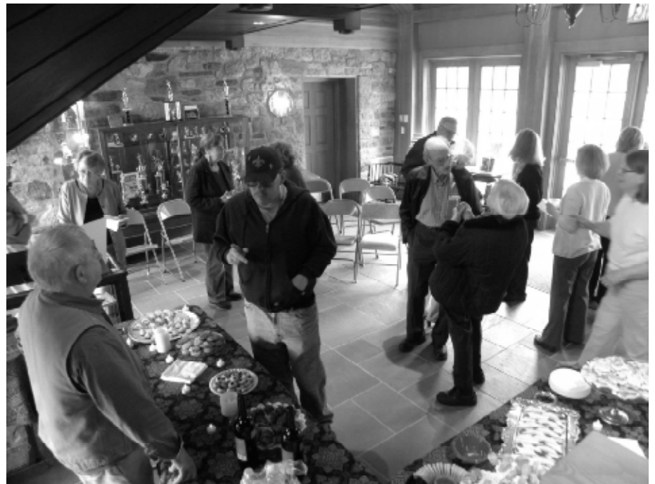
Guests enjoyed fine food and wine.