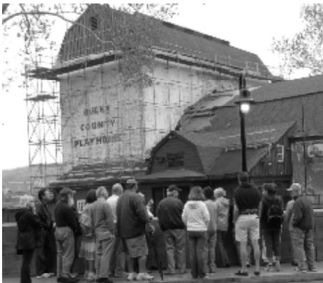
The area's most famous Mill - now the Bucks County Playhouse