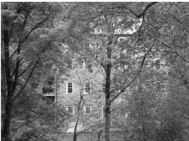
One of the few mills still standing has been converted to a residence