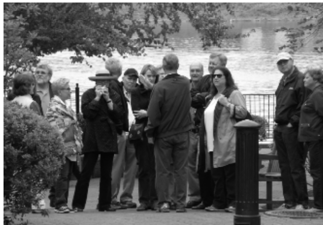
The walk began at the Ferry Landing in New Hope