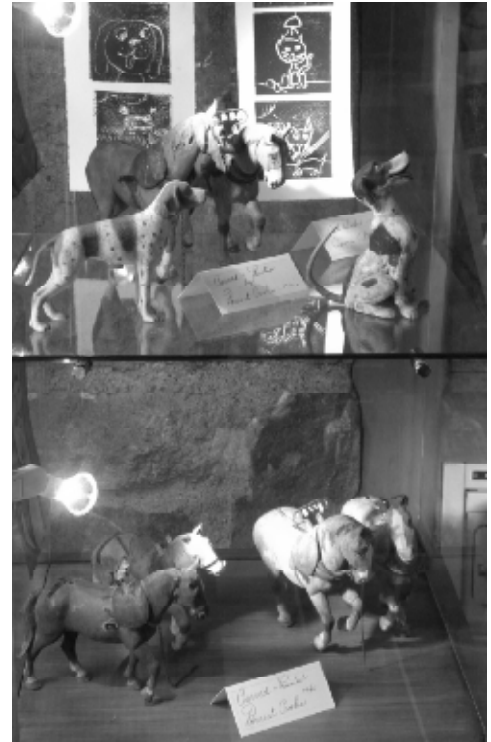
The BCSPCA exhibit includes hand carved animals, children's artwork and more