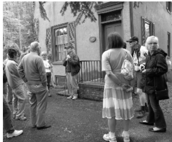
The walk concluded at the Springdale mansion, where the group enjoyed light refreshments